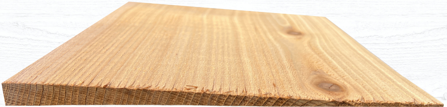
3/4x10 Knotty Bevel