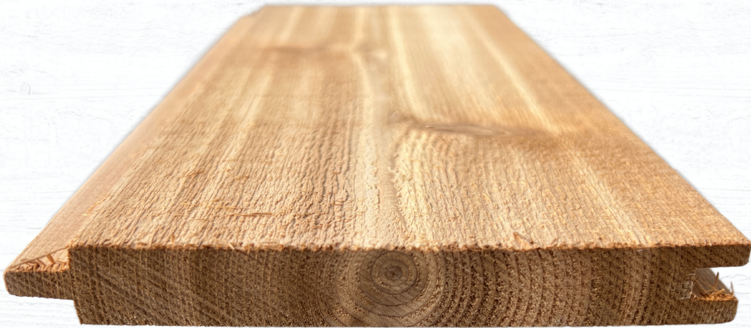
1x6 Fineline Rough