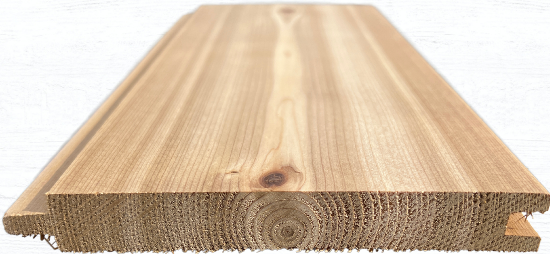
1x6 Fineline Smooth